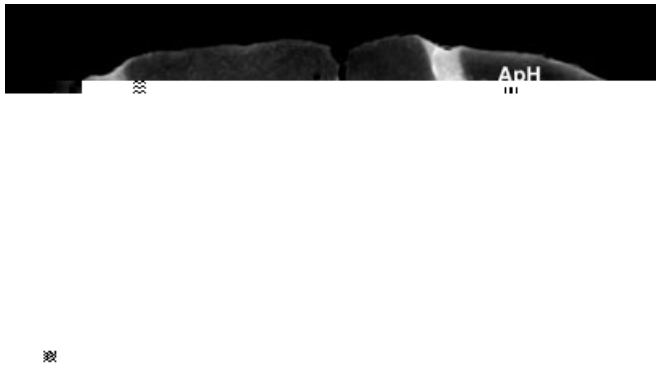
FIGURE 3. Distribution of fluorescein-labeled dextran infusions for one subject. Fluorescence appears in the right hippocampal formation (HF) and lateral to the HF in left hemisphere. With a few exceptions, fluorescence from the labeled dextran amines was confined to the hippocampal formation (which consists of the hippocampus proper and the area parahippocampalis). ApH, area parahippocampus; Hp, hippocampus; S, septum. Scale bar = 1 mm.

location and spread of fluids from the cannula infusions. Alternate sections were stained with cresyl violet and were coverslipped and examined with a light microscope.