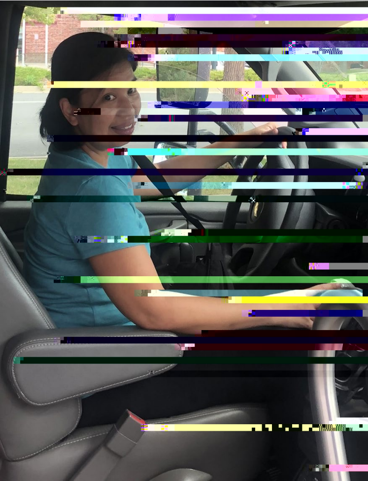
A J-1 visa holder from the Phillipines who teaches in the Centennial School District in San Luis, Colorado